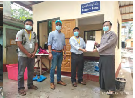
Donation of Laundry Room to Government Health Department, Myitkyina