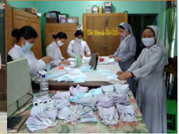
Making Masks by Sisters of Reparation