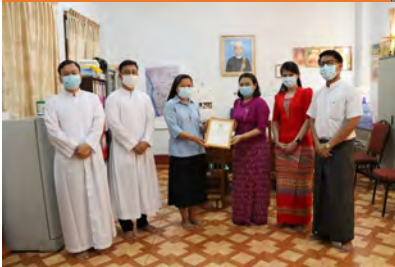
Donation of Scrub suits, Masks and Gloves