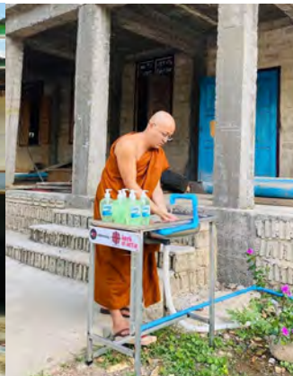
Installed Hand Washing Station, Taunggyi