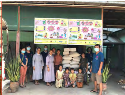
Subsistence support to Orphanage center, Taungngu