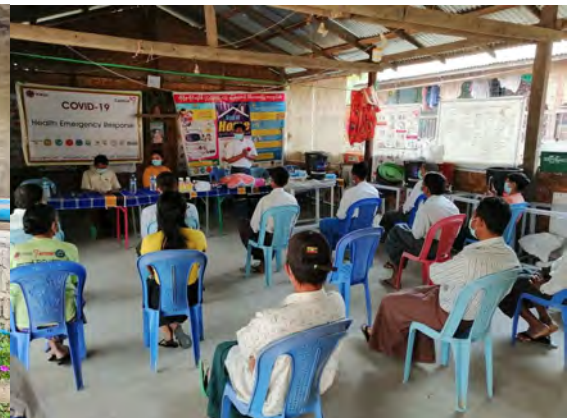
COVID-19 Awareness Session, Mandalay