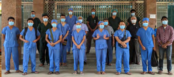
Christian Youth Volunteers in North Okkalapa Hospital