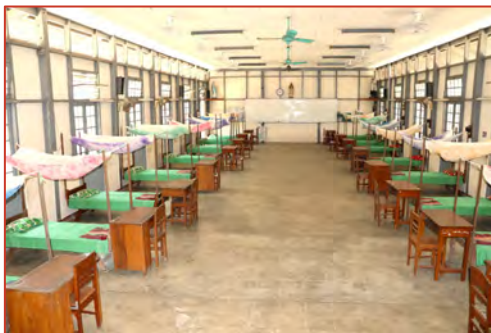
Preparation of St. Joseph's Major Seminary for Quarantine Center, Yangon