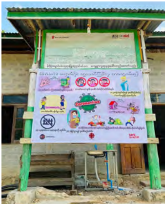
COVID-19 Awareness Posters, Taunggyi